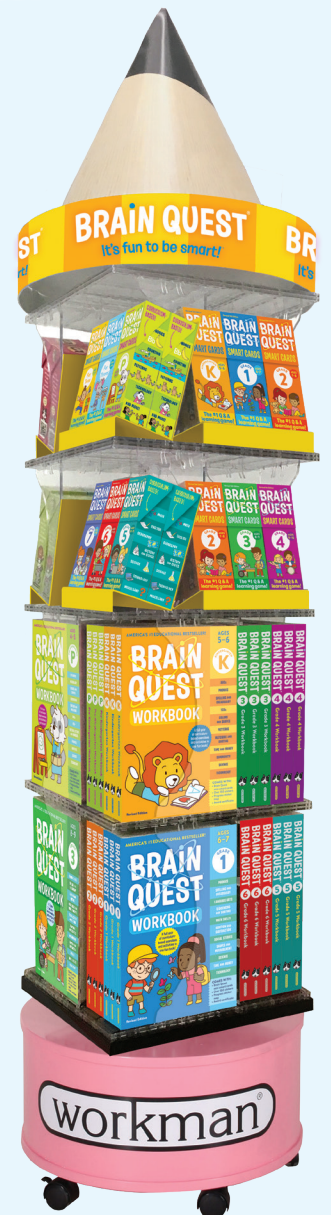
Brain Quest 48-Copy Deck and Workbook Mixed Pencil Display Decks: 4 each of For Threes, Preschool, Kindergarten, Grades 1–6. Workbooks: 4 each of Pre-K, Kindergarten, Grade 1. $585.60/$873.60 Can. ISBN: 9781523507801