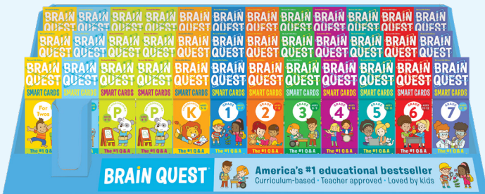
Brain Quest 36-Copy 2022 Smart Cards Display 3 each of For Twos, For Threes, Kindergarten, and Grades 1–7; 6 each of Pre-K. $467.64/$611.64 Can. ISBN: 9798885857017

Brain Quest Workbook: Pre-K Revised Edition / ISBN: 9781523517336 Brain Quest Workbook: Kindergarten Revised Edition / ISBN: 9781523517343 Brain Quest Workbook: 1st Grade Revised Edition / ISBN: 9781523517350 Brain Quest Workbook: 2nd Grade Revised Edition / ISBN: 9781523517367 Brain Quest Workbook: 3rd Grade Revised Edition / ISBN: 9781523517374 Brain Quest Workbook: 4th Grade Revised Edition / ISBN: 9781523517381 Brain Quest Workbook: 5th Grade Revised Edition / ISBN: 9781523517398 Brain Quest Workbook: 6th Grade Revised Edition / ISBN: 9781523517404