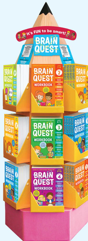
Brain Quest 36-Copy Workbooks Pencil Display 4 each of Pre-K, Grade 3, and Grade 4; 8 each of Kindergarten, Grade 1, and Grade 2. $466.20/$682.20 Can. ISBN: 9780761150855