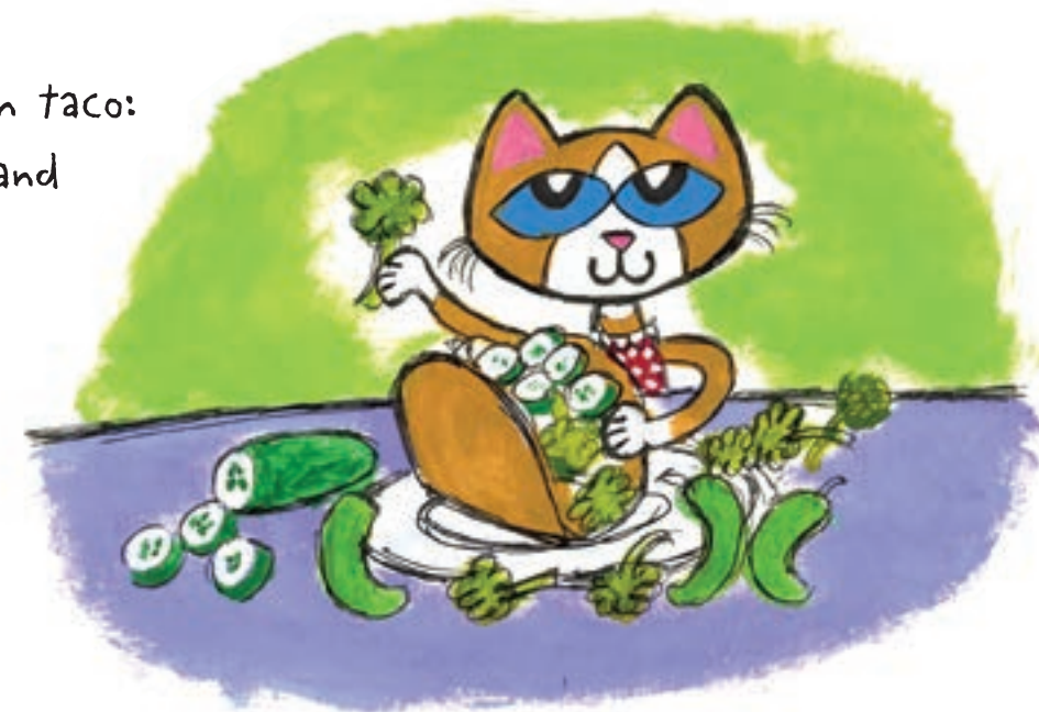
Mom makes a green taco: cucumbers, peppers, and broccoli.