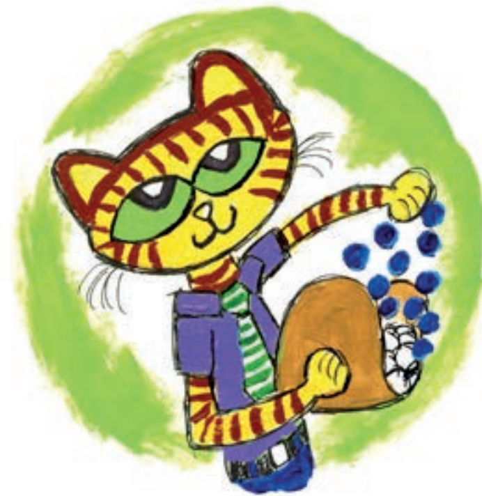
Dad fills his with berries and cream.