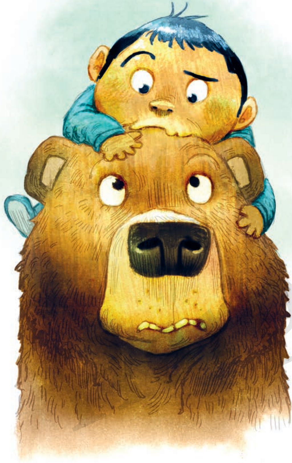
Bear is a snack.