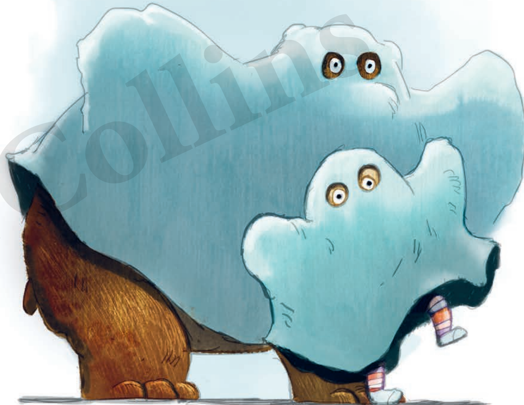
Bear is a ghost.