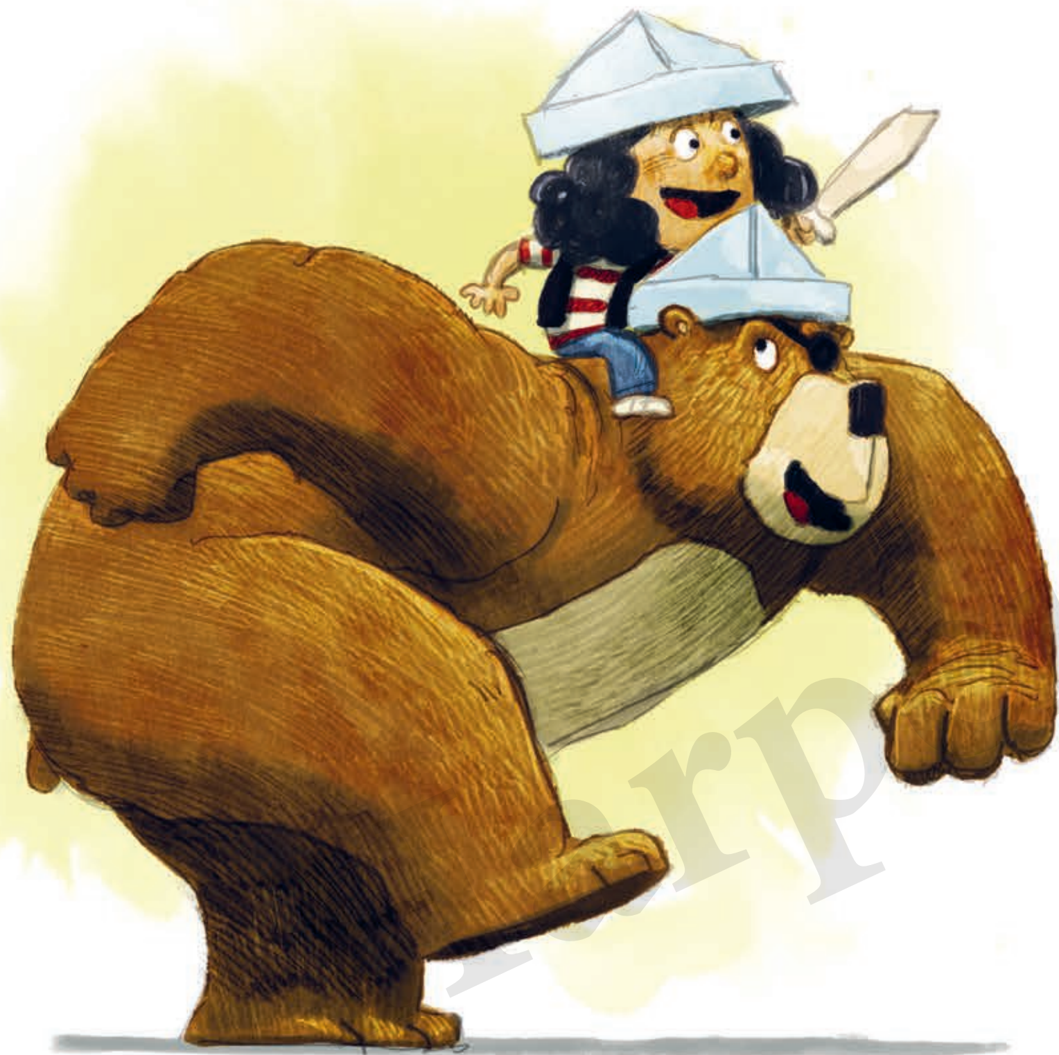
Bear is a pirate.