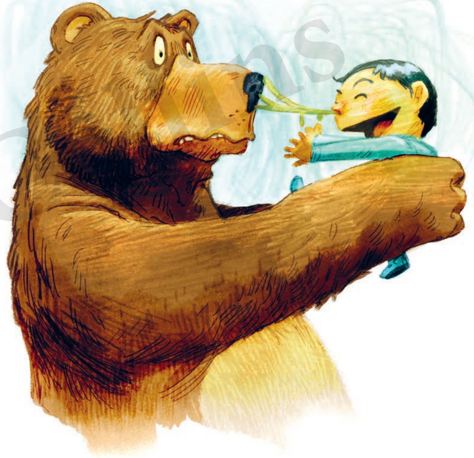
Bear is a tissue.