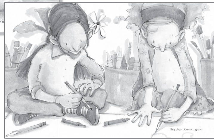
They drew pictures together.