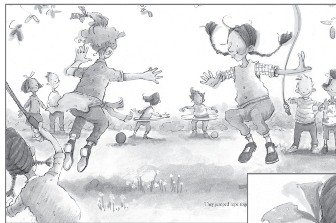
They jumped rope together.